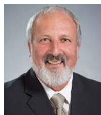
J. Sprovieri City of Brampton Wards 9, 10