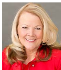
B. Shaughnessy Town of Caledon Ward 1