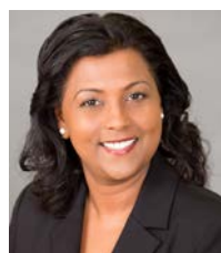
A. Groves Town of Caledon Ward 5