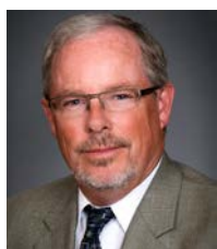
G. Gibson City of Brampton Wards 1, 5