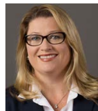
K. Ras City of Mississauga Ward 2