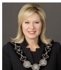
B. Crombie Mayor City of Mississauga